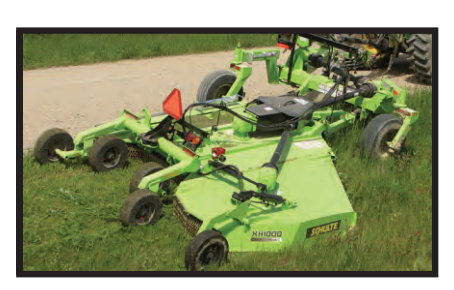
Shown with XH1000 Series 3