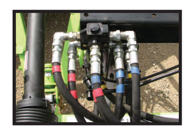
Optional selector valve for limited hydraulics