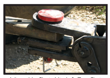
Adjustable Clevis Hitch & Tow Chain