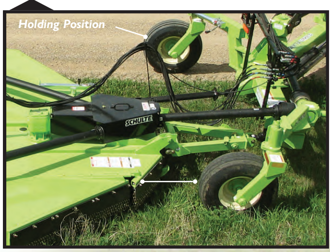
The Schulte FLX-1510 with its new drive system can mow directly behind the tractor as needed with no driveline vibration

Placement of the tires are very important! The left tire tracks on top of the road. This creates a holding position to prevent side drafting. The right tire is placed directly on the hingeline of the center section and right wing, where the blades intersect. This is the best placement for a tire as the blades pick up the only wheel track and prevents almost all stripping. Competitive arms use two tires in the ditch and will tramp down more grass, causing it to strip.